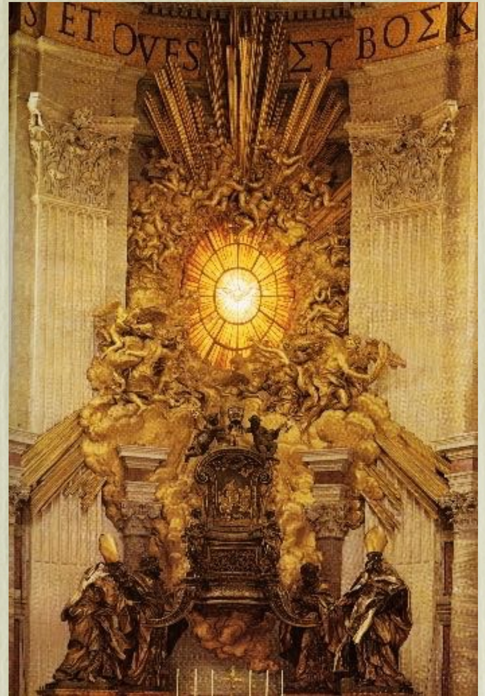
St Peter's Basilica, Rome

Included also is the realm of religious faith. As regards the religious beliefs that are at the heart of the Christian tradition, our reliance is on Jesus himself and on the many wonderful human beings who have believed in him and whose lives have an excellence acknowledged by anyone who cares to investigate. Such faith goes beyond the realm of reason, but it is not without supporting evidence.