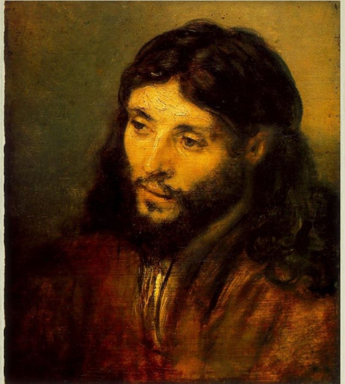
Jesus' face Rembrandt

Of special importance is our communion in love with those who have given themselves over to the attraction of grace and allowed God to permeate their being.