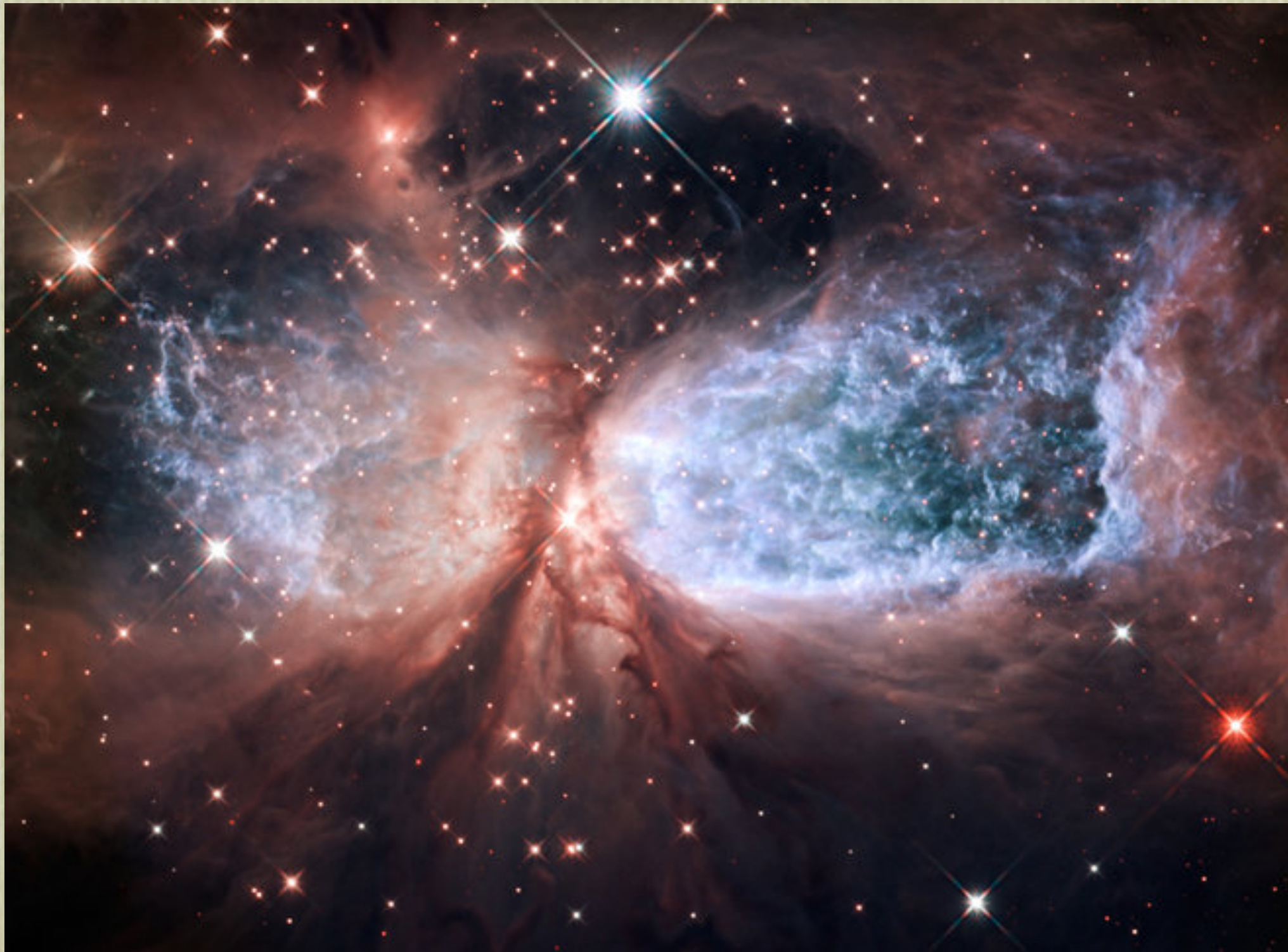
NGC 1672: Barred Spiral Galaxy from Hubble