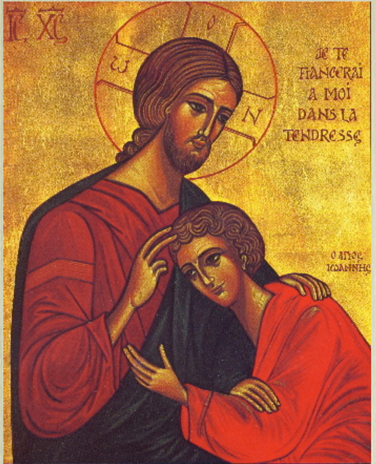
from an icon of Christ and Saint John Dormition Abbey, Jerusalem.

In the prologue to his Gospel, John expresses it in this way: 'The Word became flesh and lived among us, and we have seen his glory, the glory as of a father's only son, full of grace and truth ... From his fullness we have all received, grace upon grace ... No one has ever seen God. It is the only Son, who is in the bosom of the Father, who has made God known' (John 1:14,16-18).