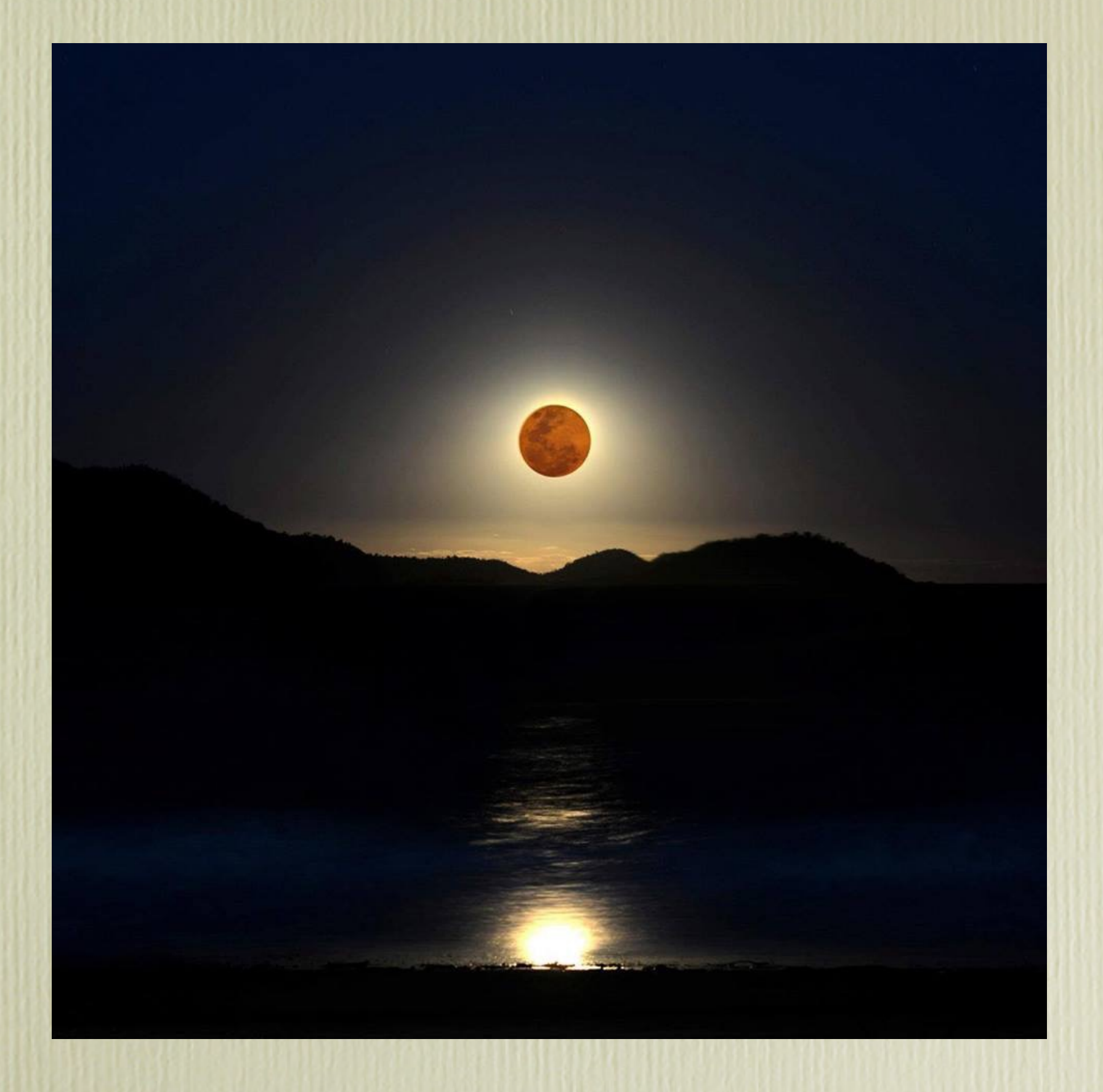
Lead Kindly Light