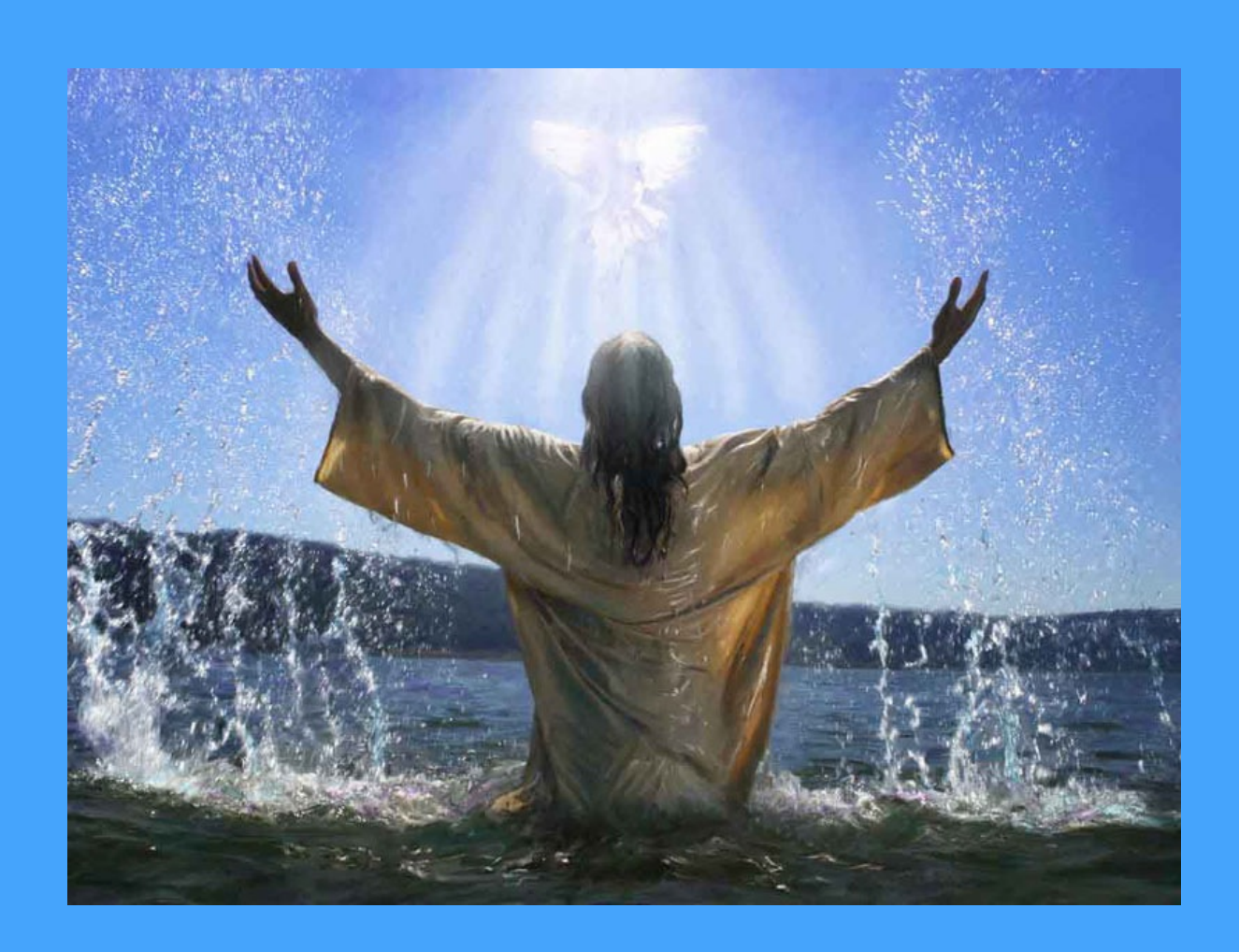
Here I am Lord

Text based on Isaiah 6 Words and Music Dan Schutte © 1981 Dan Schutte and New Dawn Music OCP Octavo/Bonus Music 44. Reprinted with permission under One License A-642681. All rights reserved