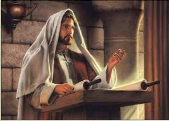
Jesus, Bread of Life