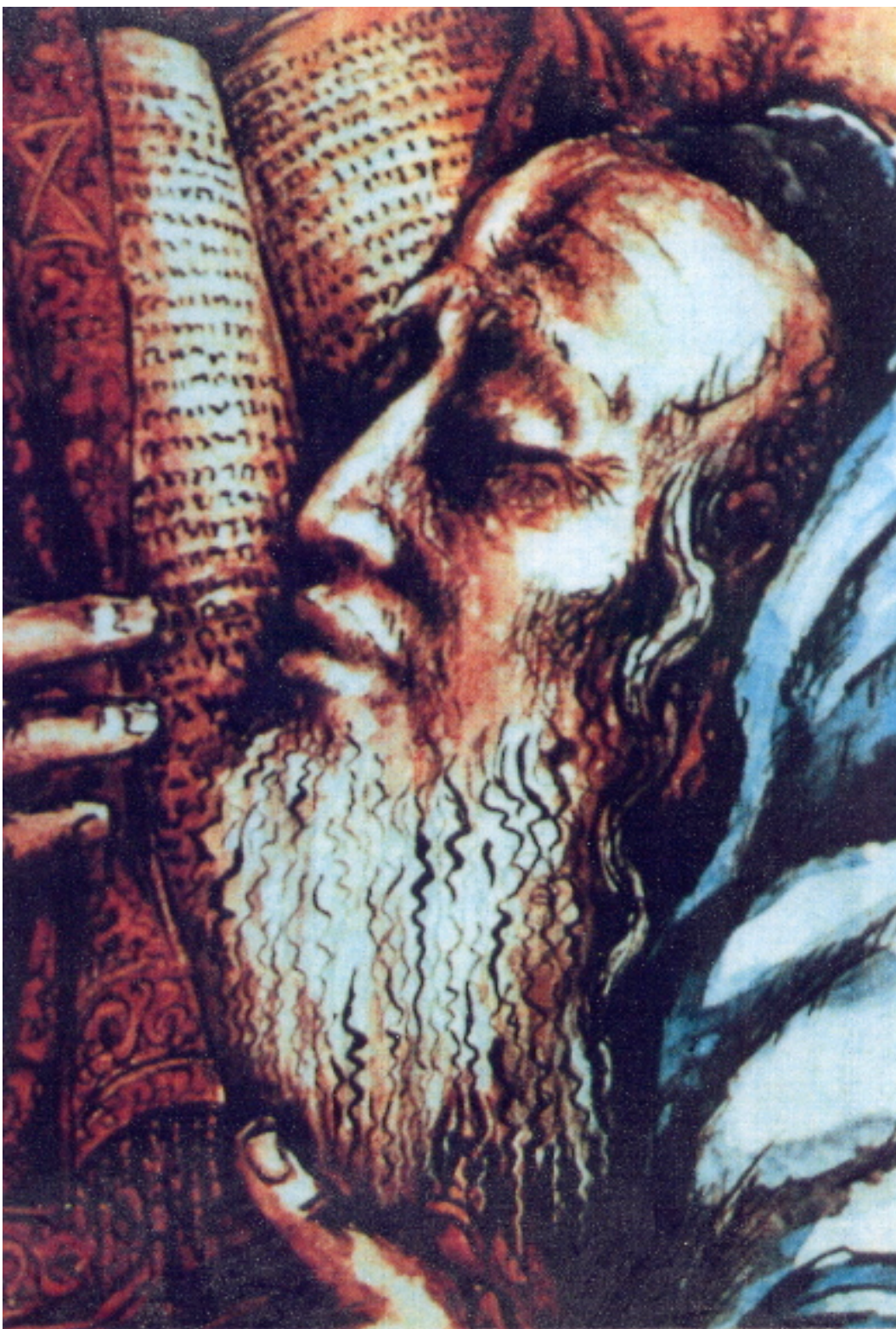
Rabbi kissing the scroll of the Torah