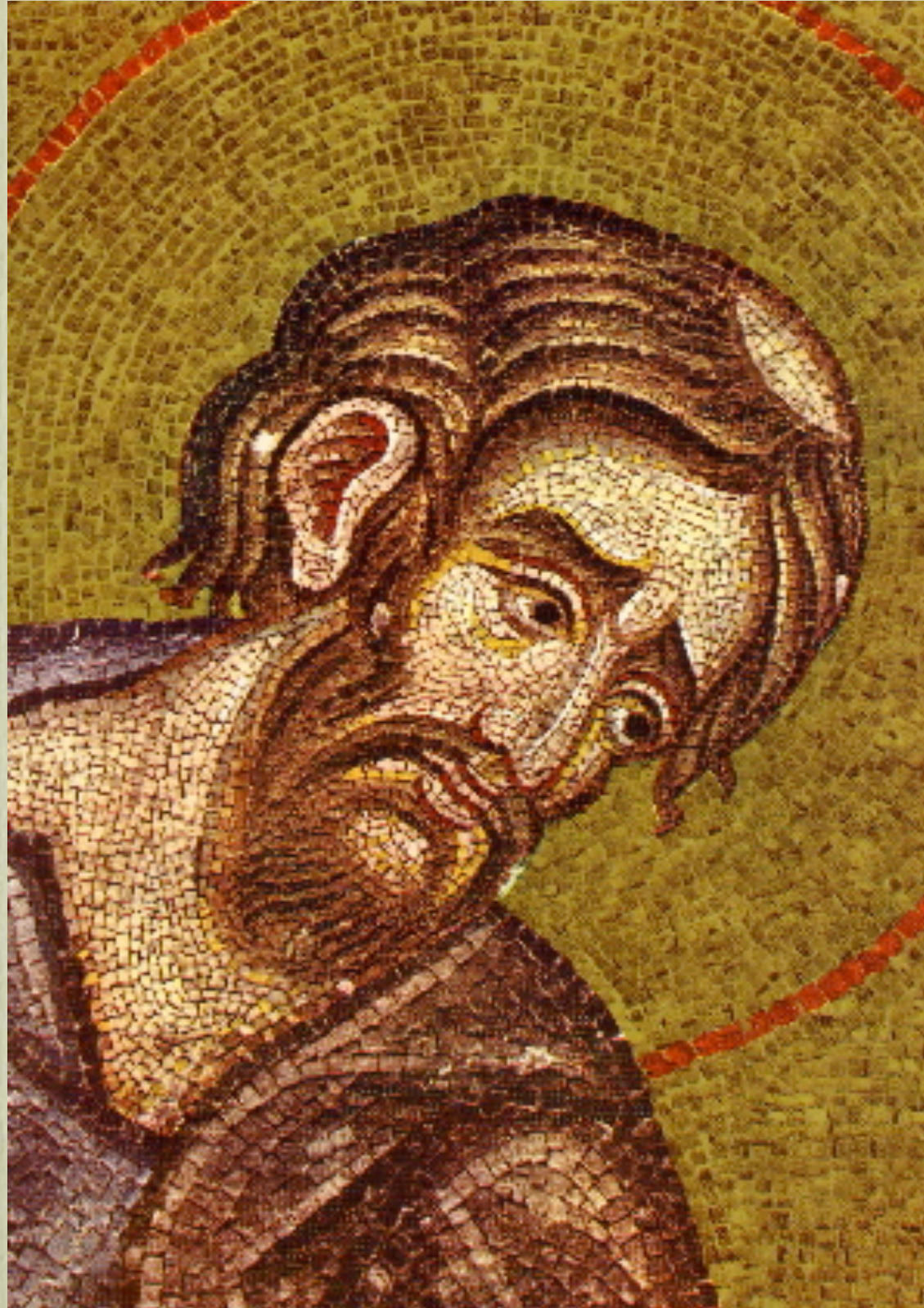
Luke (San Marco, Venice)