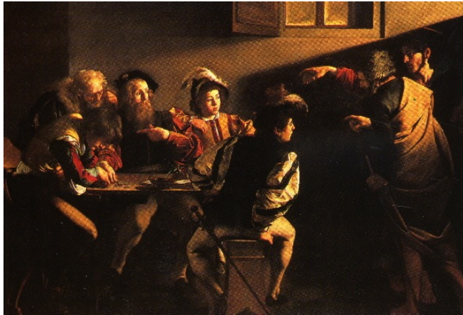
Caravaggio 'The Call of Matthew'