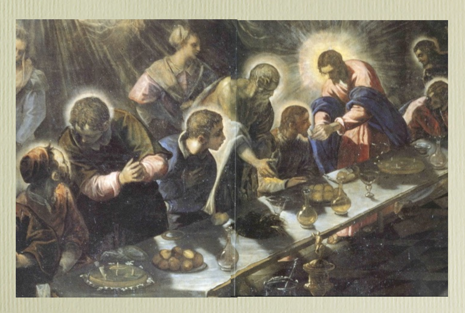
Jesus, Bread of Life