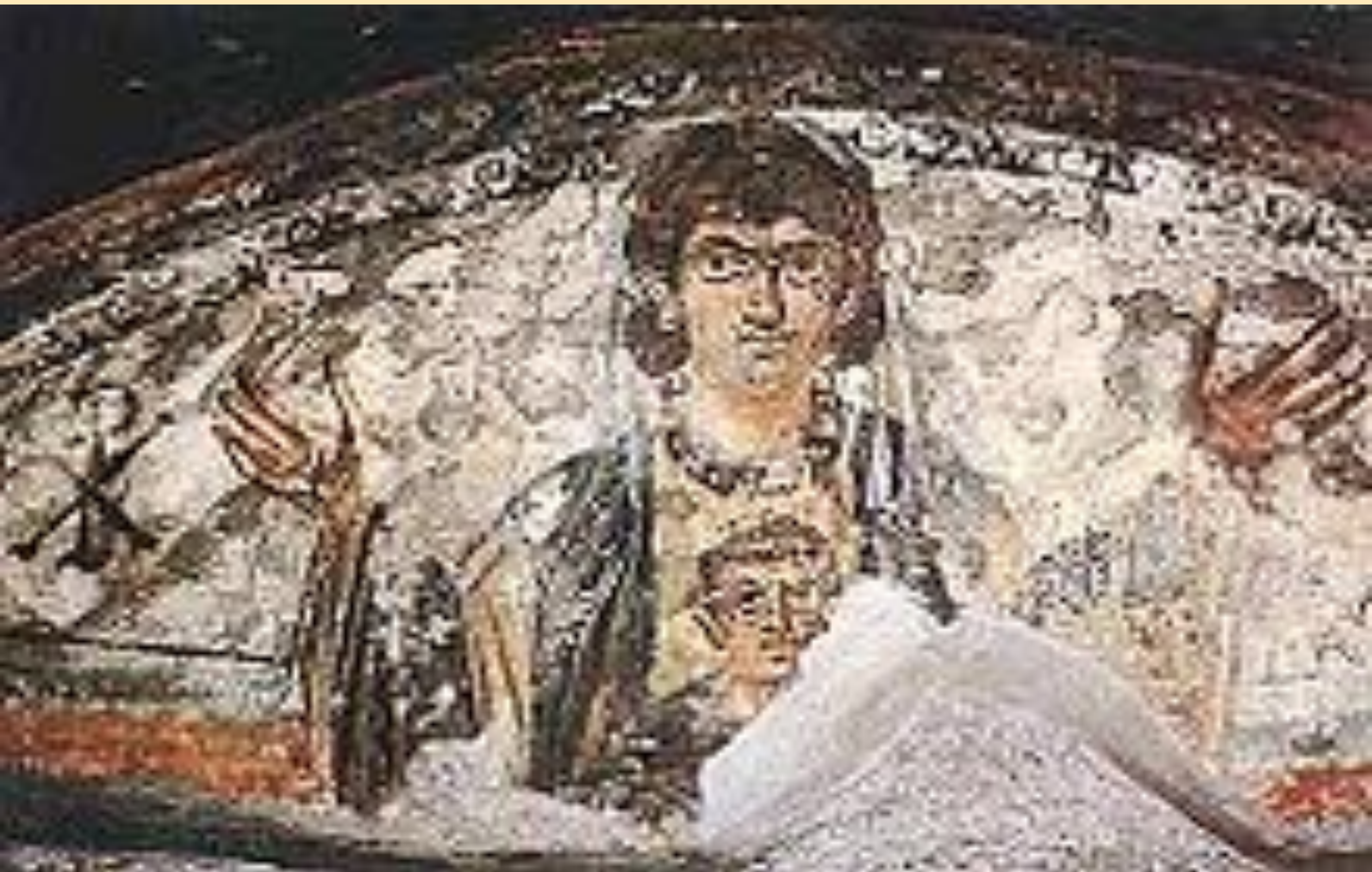
Virgin and Child. Catacombs, Rome, 4th century.