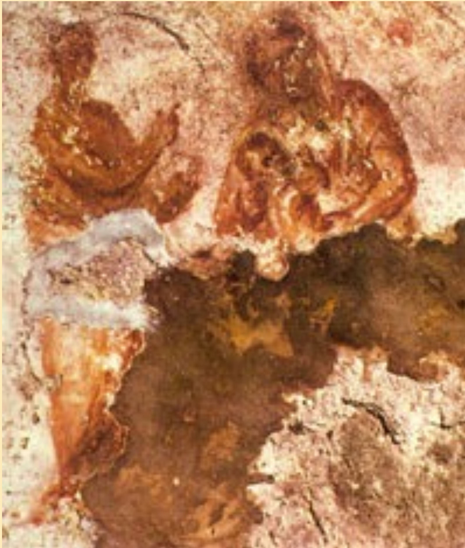
Catacomb of Priscilla, Rome